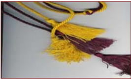
National has Tau Sigma T-shirts and Honor Cords - $10.00 each.

a list of the members, their membership forms, the induction materials (certificates and pins), a charter, honor cords, t-shirts, and a check for the local dues. At that point, you will simply schedule a meeting for the members, elect officers, and the chapter will be off and running!